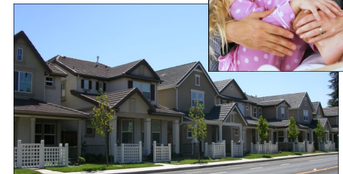
Affordable Units at Arbor Village