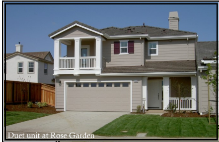
Duet unit at Rose Garden