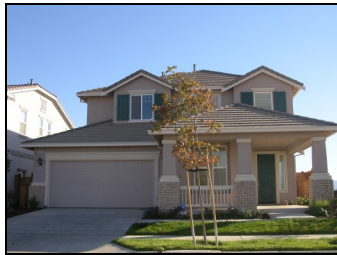
Affordable Unit at Brighton Station

The State of California has declared that the availability of housing is of vital statewide importance, and the early attain-