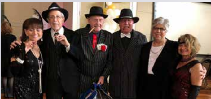
Friends having fun at the Roaring 20s New Years Eve Party.