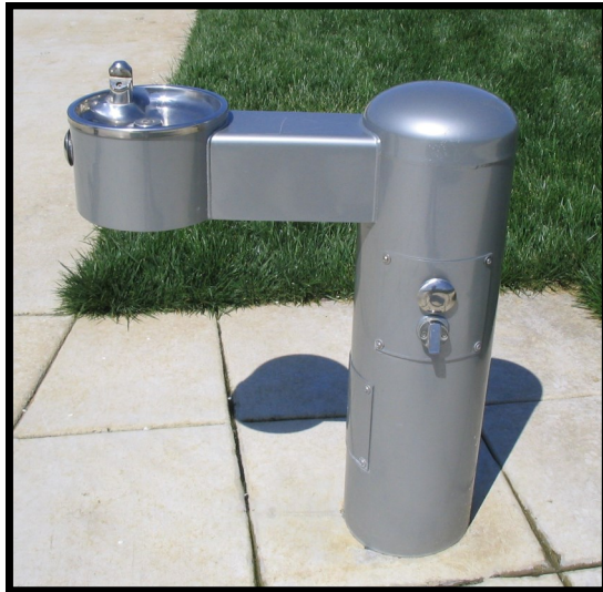
Sample water fountain, shown without plaque