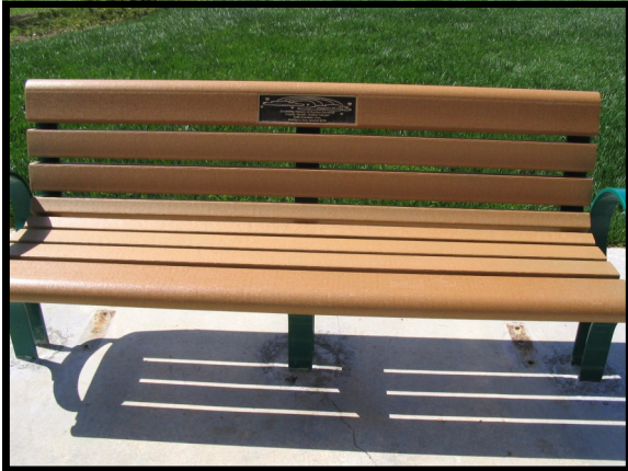
Memorial Bench on Outrigger Circle