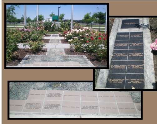
Memorial Tiles are only available at Veterans Park.

Locations for the trees and amenities may be in a City park or facilities. Parks and Recreation staff will assist you in the selection of a park or facility along with the selection of the dedication item.