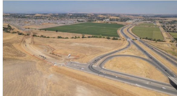
Sand Creek Road Extension

The construction for the Sand Creek Road Extension project is currently underway and expected to be completed in FY 2023/24. This project is funded partially by Roadway DIFs. The Wastewater Treatment Plant (WWTP) Expansion – Phase II project is currently under construction. This project is funded through a State Revolving Fund (SRF) loan, which will be repaid in part by Wastewater DIFs. Additional budget information regarding CIP projects funded by DIFs is shown in the table on page 26.