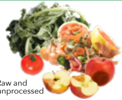
*Raw and unprocessed