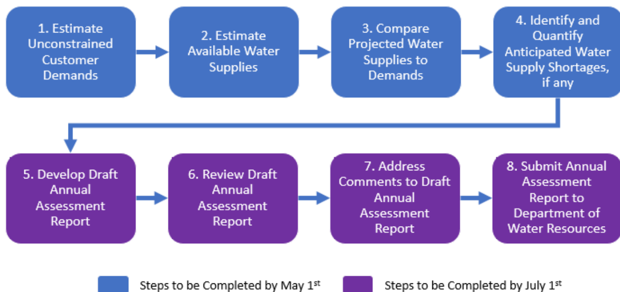
Figure 2-1. Annual Assessment Procedure and Decision-Making Process

Step 8. Submit Annual Assessment Report to DWR – The City submits the Annual Assessment report to DWR.